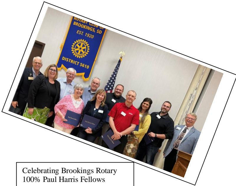
Celebrating Brookings Rotary 100% Paul Harris Fellows