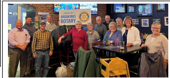
Brookings Rotary coat drive at a Thirsty Thursday at Cubbys