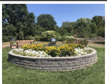
Planting Rotary Garden at McCrory Gardens