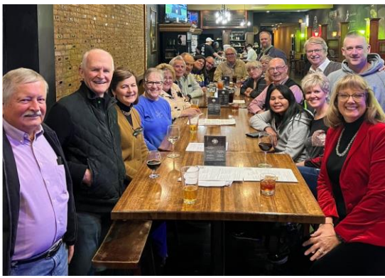
The Rotary celebrators at Pints and Quarts