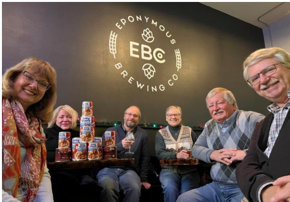
GET THEE TO A THIRSTY THURSDAY