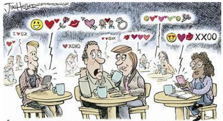
"BACK IN MY DAY, I DROVE 10 MILES TO THE MALL IN THE SNOW, UPHILL BOTH WAYS, JUST TO GO BROKE BUYING A VALENTINE'S DAY CARD, FLOWERS + CANDY!"